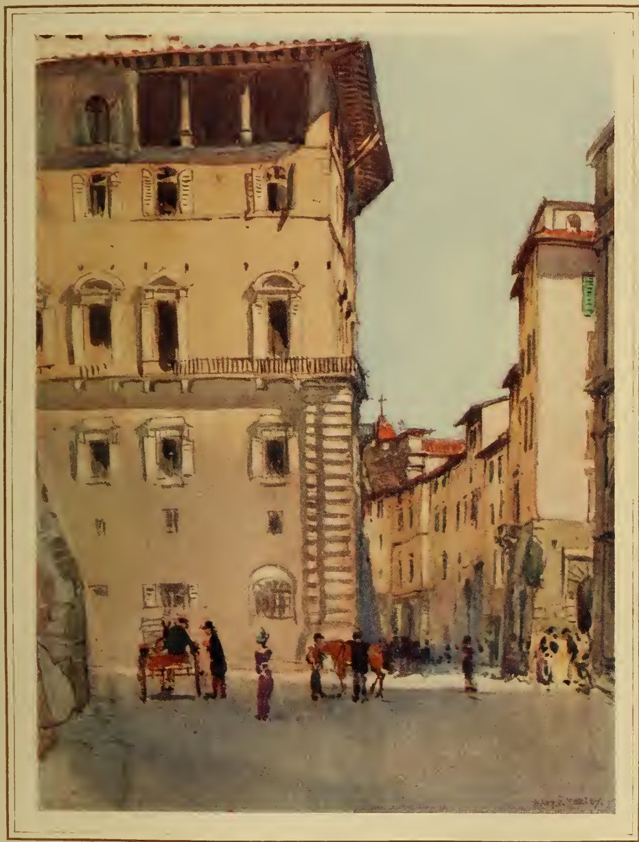
THE LOGGIA OF THE PALAZZO VECCHIO AND THE VIA DE' LEONI